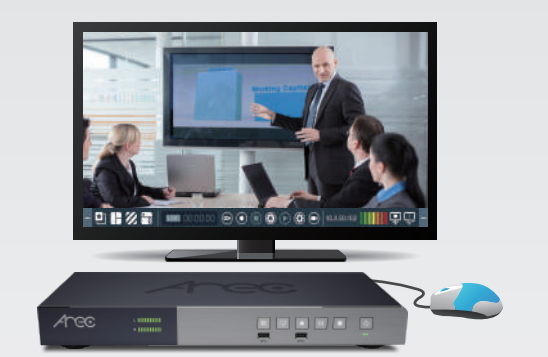
On-screen GUI with mouse/ touch USB control

AREC LS-410 supports a wide range of control options: web-based Online Director (Chrome, Edge), touch-friendly Graphical User Interface, Mini Controller for Mobile Devices, physical control buttons, and RS-232/TCP commands among others.