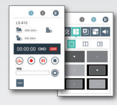
Mini Controller from Mobile Devices